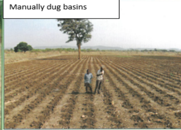
Manually dug basins